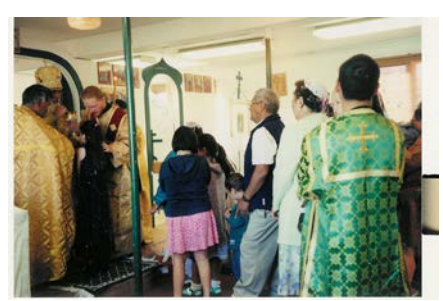
Worshiping in the rented Moravian Building since February 2000.