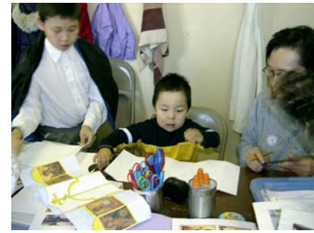
First Sunday School Program developed on the second floor of the Moravian building in 2006. "Sister Parish" project of Outreach Alaska – Building on a sure foundation!